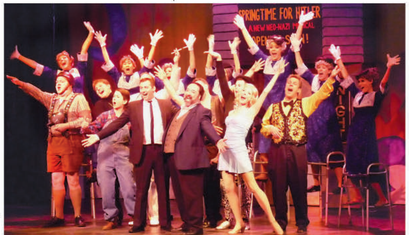
TMP's production of The Producers .