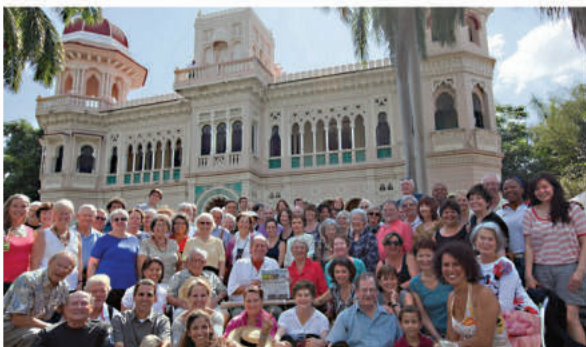
Northwest Sinfonietta members and patrons during their recent performance tour in Cuba.

Northwest Sinfonietta has been producing quality classical music for twenty-one years with residencies in Seattle, Tacoma, and Puyallup. The orchestra just concluded its first international tour to Cuba as only the third U.S. orchestra to visit since the 1959 Revolution. The ten day trip culminated with three historic performances where U.S. and Cuban musicians performed side-by-side. Fifty-three patrons accompanied the orchestra on the tour. For more information on their recent tour, Maestro Gerard Schwarz guest-conducting in June, and future collaborations with Cuba, please visit www.northwestsinfonietta.org or www.facebook.com/northwestsinfonietta .