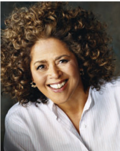
Anna Deavere Smith will be ArtsFund's 2012 luncheon keynote speaker.

ArtsFund thanks LithoCraft for providing printing and production support of this newsletter.