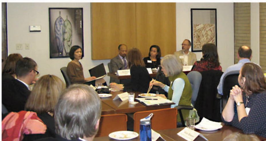
Students of a Board Leadership Training class collaborate to address fiscal situations and improve their leadership skills.