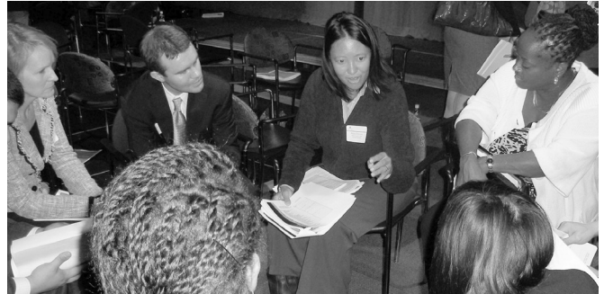
A team of Associates discusses upcoming Campaign 2010. A record number of 137 Associates are volunteering for ArtsFund this year!