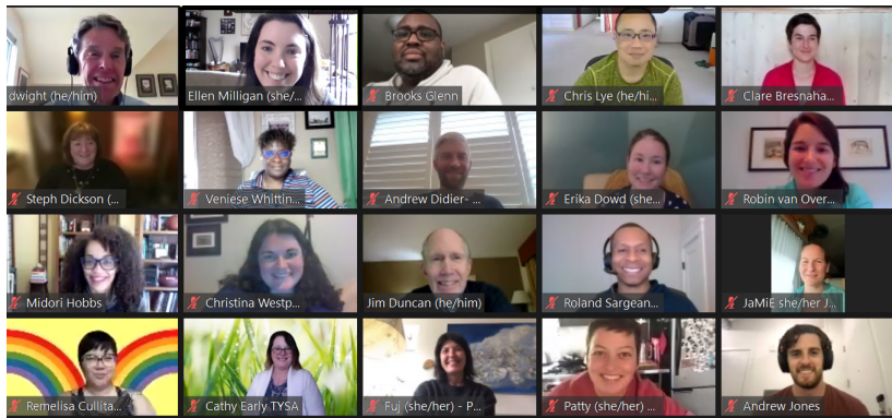
Board Leadership Training participants, spring 2021

“One of the most valuable trainings I have ever participated in on any subject.”