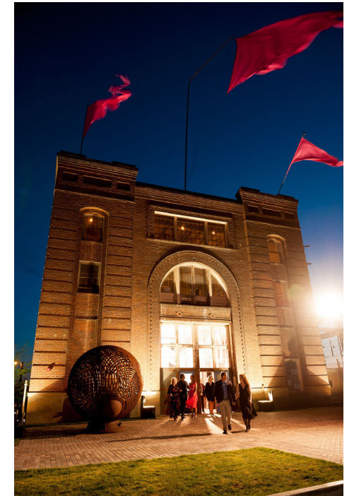
Power House Theatre Walla Walla

This cycle marks an increase in funding to this important program for the first time in 30 years, making more support for capital projects available to more arts and cultural groups. For example, ArtsFund cultural partner Path with Art's project, ArtHOME, will provide a new art space that will serve no-to-low-income adults in active recovery from homelessness, addiction, mental and physical health challenges, domestic violence, and other traumas. For more information and a full list of funded projects, visit artsfund.org/building-for-the-arts .