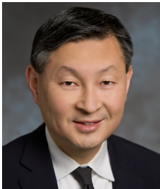
Sung Yang Pacific Public Affairs