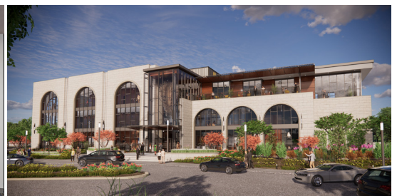
Photo credits, from left to right: Tacoma Arts Live, Festival Latinx Event; Seattle Children's Theatre, rendering by ORA; Spokane Valley Performing Arts Center, rendering by NAC Architects